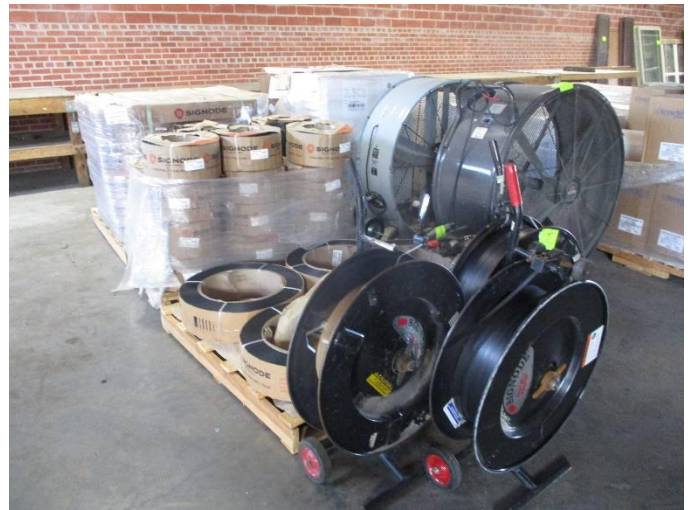
2 PALLET SIGNODE STRAPPING W/AIR BANDERS & TOOLS