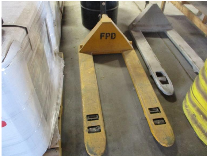
2 HYD. PALLET JACKS