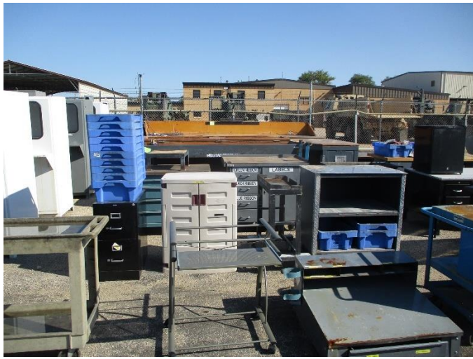
CABINETS & TOTES