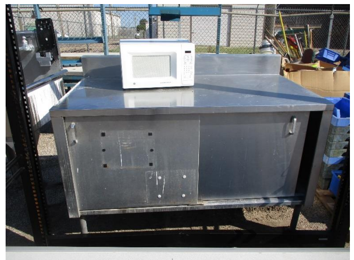
STAINLESS STEEL CABINET - MICROWAVE