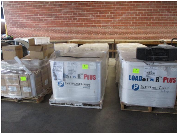
10 PALLET LOADSTAR PLUS STRETCH FILM (SHRINK WRAP)