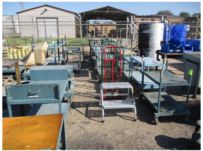
WORK TABLES, PLASTIC WATER TANK, STEP STOOLS, 2 & 4 WHEEL DOLLIES