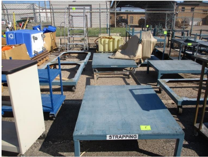
HEAVY DUTY SHORT WORK TABLES