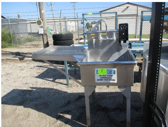
STAINLESS STEEL WORK SINK