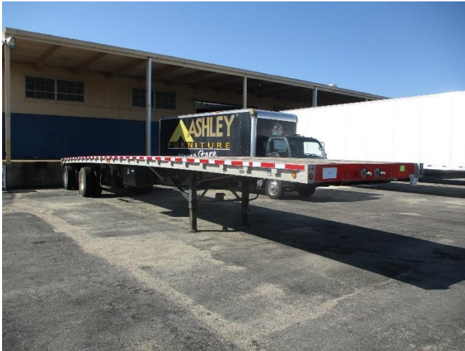
2008 WILSON SPREAD AXLE AIR RIDE FLATBED TRAILER 48' X 96" ALUMINUM/STEEL COMBO

10% Buyers Premium and 9.25% Sales Tax will be charged