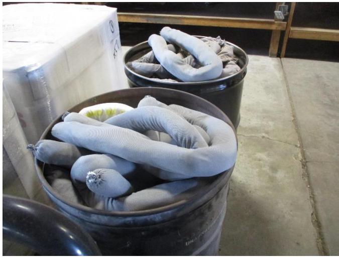
2 BARRELS OF ABSORBENT SOCKS