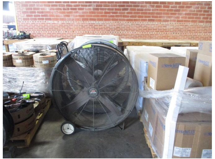
2 SHOP FANS