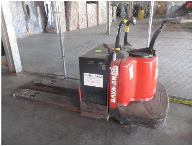
RAYMOND ELECTRIC PALLET JACK