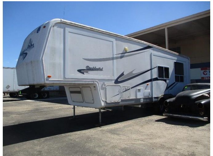
2003 HOLIDAY RAMBLER