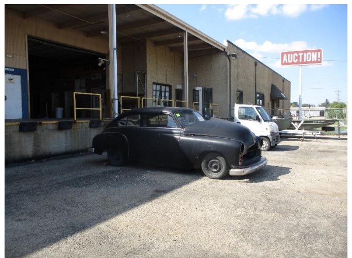
1951 PLYMOUTH CONCORD