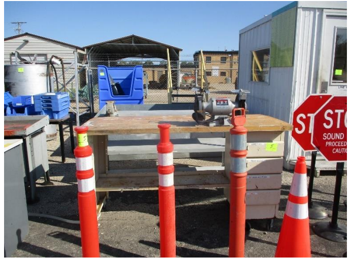
ROAD DELINEANTORS, CONES AND STOP SIGNS