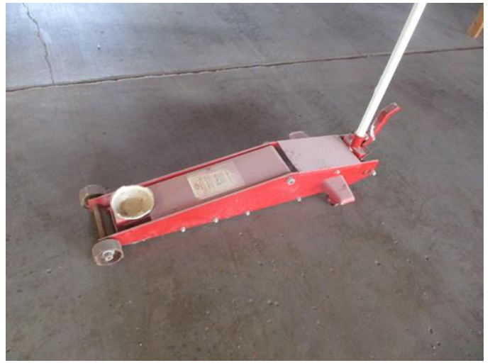
AMERICAN 4500 LBS. HYDRAULIC FLOOR JACK