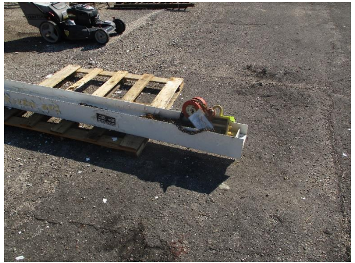
KONECRANE W/CM SERIES 622 ½ TON OVERHEAD HOIST CRANE