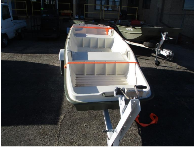
14' COLEMAN 2 PERSON BOAT-DOUBLE HULL- MODEL J12 WITH TRAILER