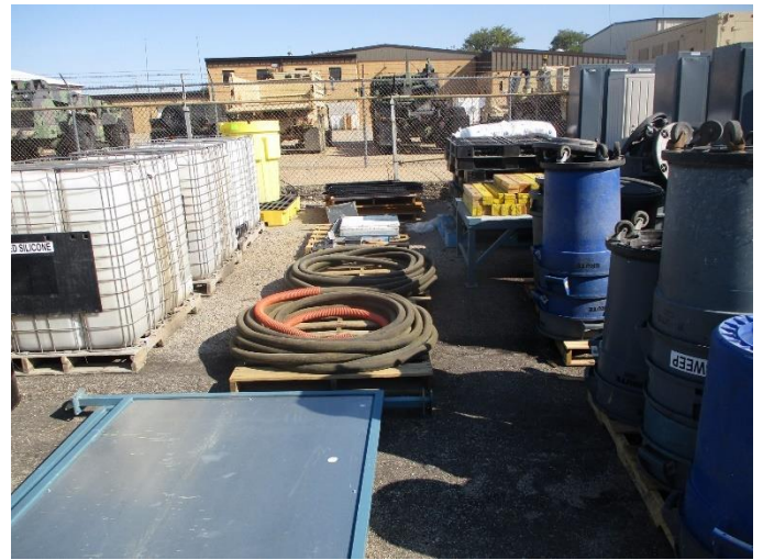
PLASTIC TUBES – AIR HOSES – TRASH CANS

Currently accepting items for consignment Check back for updates!!