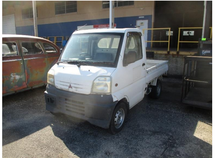
MITSUBISHI MINI-CAB RIGHT HAND STEER TRUCK NOT A TITLED VEHICLE