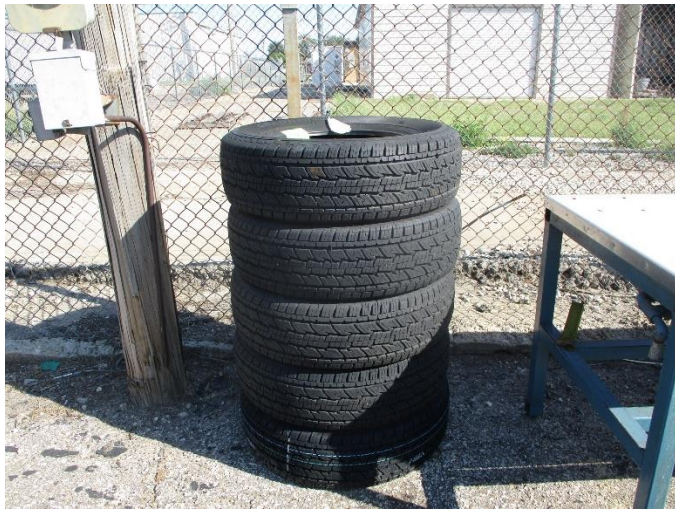
5 GENERAL GRABBER 255/70 R17 TIRES TAKES OFFS FROM KS. DEPT. OF WILDLIFE