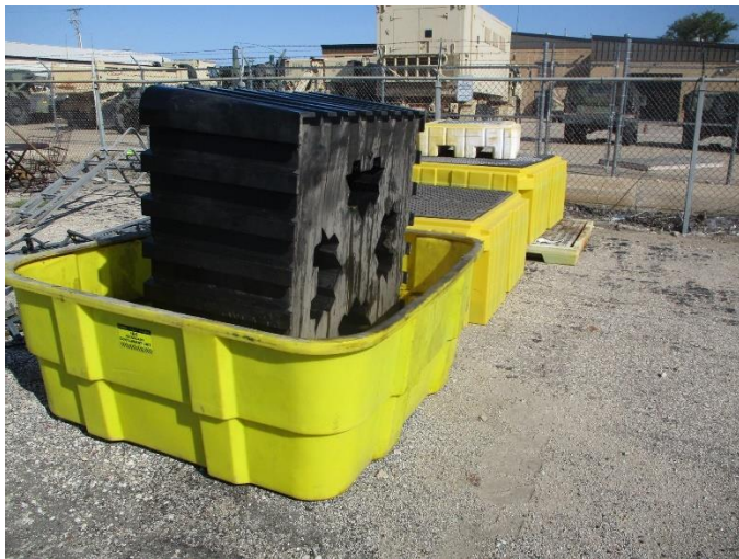
EAGLE-IBC SECONDARY OIL CONTAINMENT UNITS