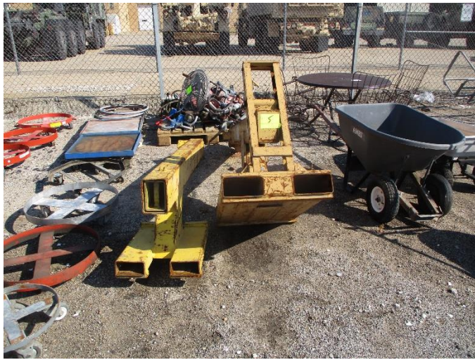
HERCULES MOD BI-668P FORKLIFT ATTACHMENT CRANE AND UNKNOWN MAKER (FORKLIFT CHERRY PICKER)