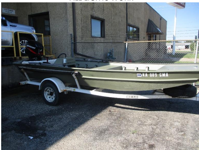
PRO WELD 17' FLATBOTTOM BOAT W/40 HP MERCURY MOTOR (FISH & GAME)