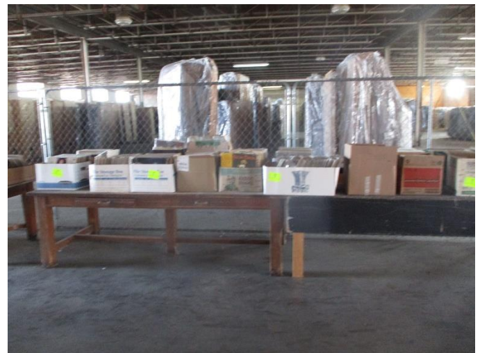
35 BOXES OF ASSORTED ALBUMS