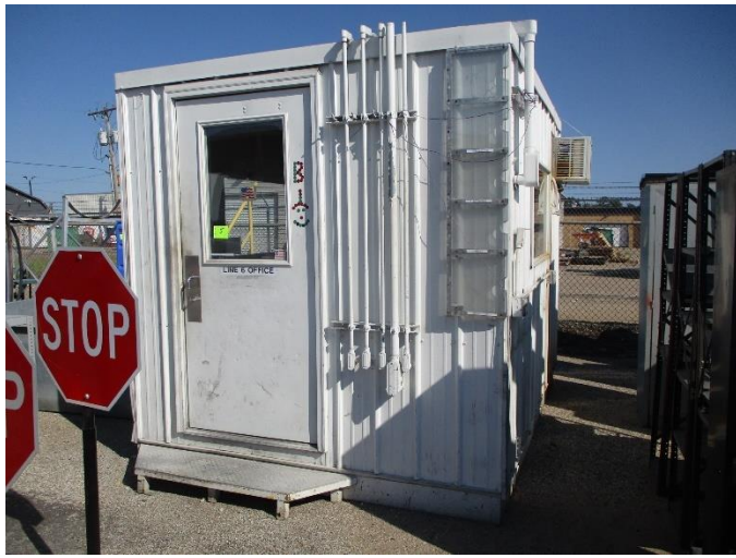
8' X 10' ALL STEEL OFFICE BUILDING W/AIR CONDITIONER