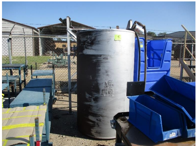
FUEL TANK ON STAND