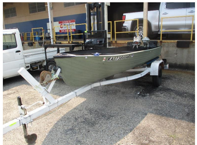
16' V-BOTTOM BOAT W/TRAILER – 1945 SEA KING MOTOR 1960 JOHNSON MOTOR + TROLLING MOTOR