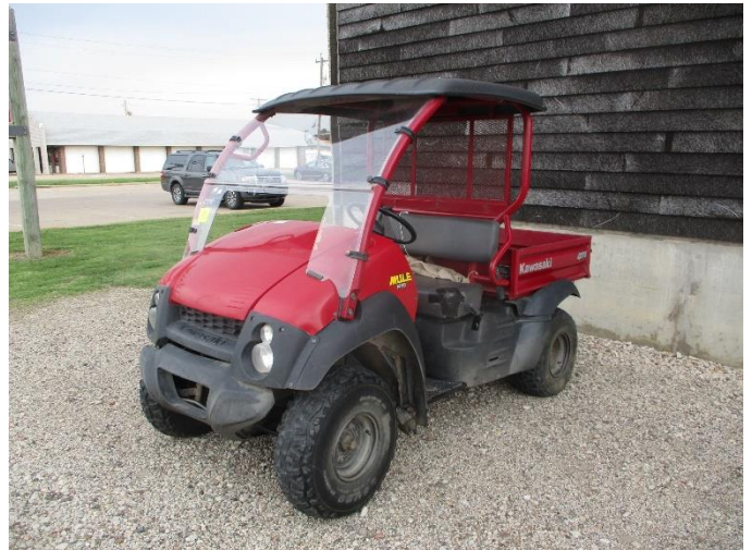
2006 MODEL 610 KAWASAKI MULE 4 X 4