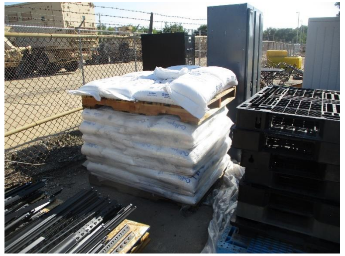
PALLET OF PLUS CULLIGAN WATER SOFTENER SALT