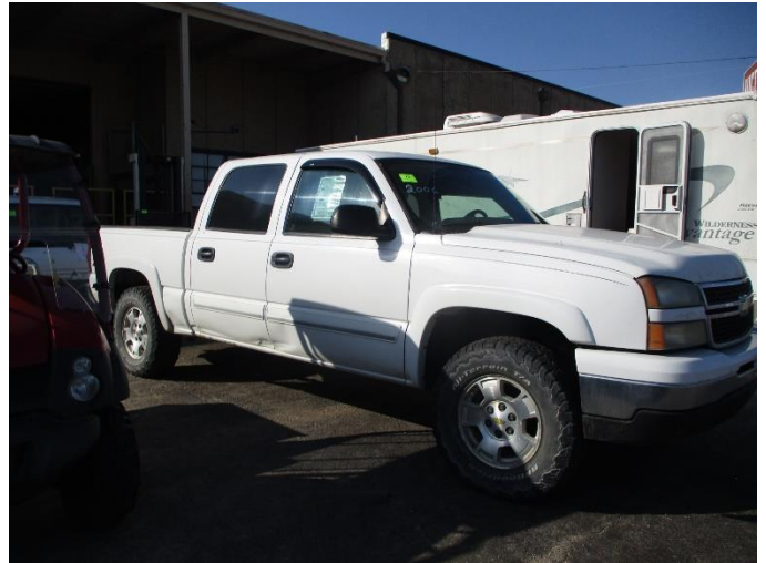
2006 CHEVY SILVERADO