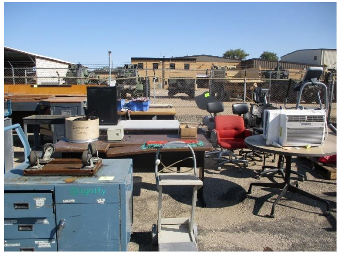
AIR CONDITIONER – DOLLIES – ROUND TABLES - CHAIR