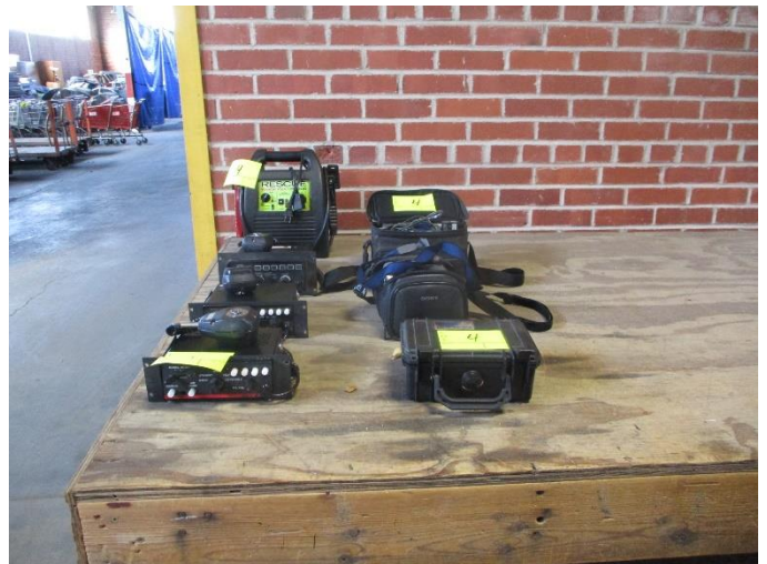
RESCUE BOOSTER PACK/SIRENS/CAMERAS/INTOXIMETER (FROM KS DEPT. OF WILDLIFE)