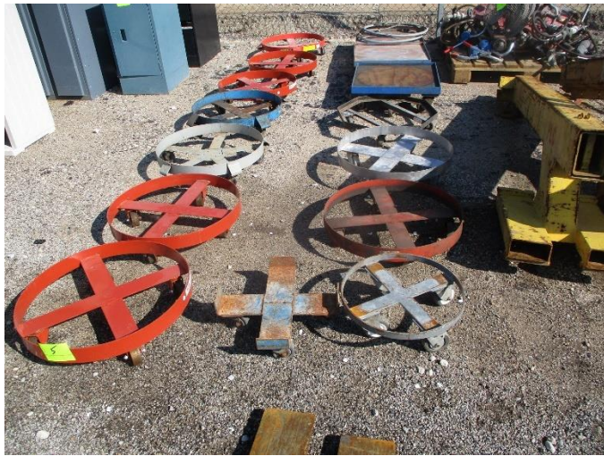
TRASH CAN DOLLIES