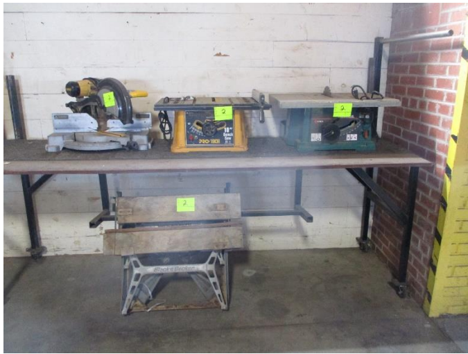
BLACK/DECKER WORKMATE – 10" PRO-TECH BENCH SAW MAKITA 10" BENCH SAW – DEWALT MITER SAW