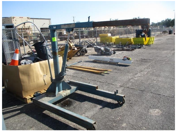
HERCULES MODEL 01-221A 2000# CAPACITY FLOOR CRANE (ENGINE HOIST)