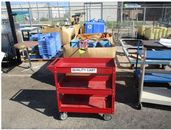
UTILITY CARTS, GREEN STEEL CARTS, PLASTIC TOTES & TUBS, BOX OF RAKES, BROOMS, SHOVELS, ETC.