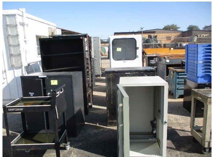
CABINETS & TOTES