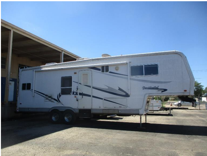
2003 HOLIDAY RAMBLER