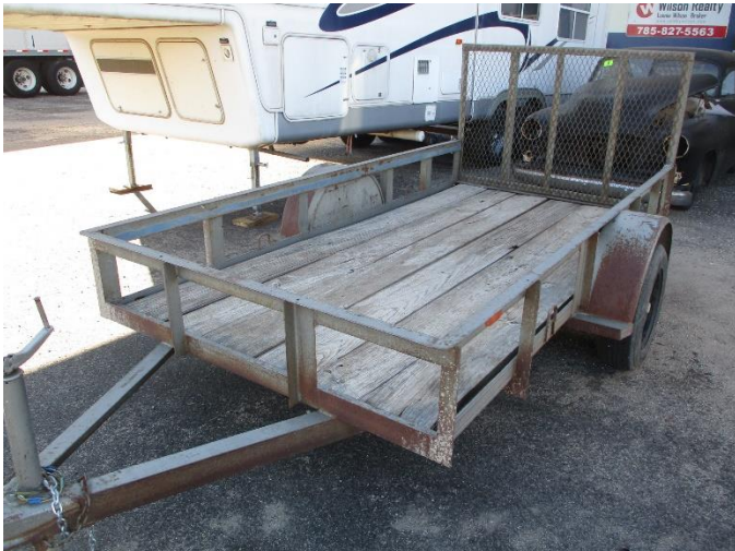
10'X 5' SINGLE AXLE GATED TRAILER – NEW SPARE TIRE ALL LIGHTS WORK